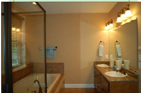
Master Bath Jet Tub