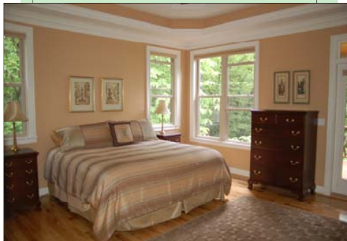
Master Bedroom /King

4 Bedrooms (3 Kings) (1 Queen) 3.5 Baths (Master with Jet Tub) Bonus Room with Twin Beds Built 2008 3336 Heated SF Fully Equipped Gourmet Kitchen 2 Garage Additional Parking (5) Media Room/Direct TV/Surround S Phone Wireless Internet Access Luxury Linens Provided