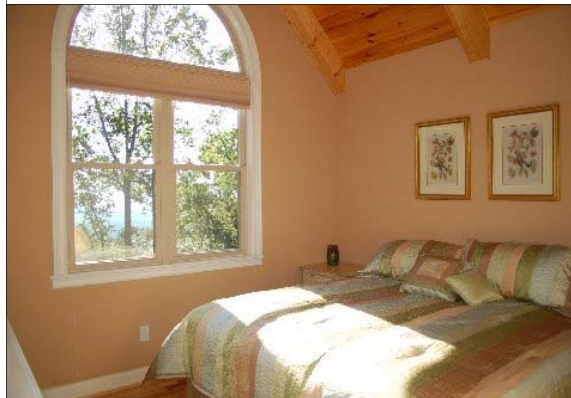
Bedroom 3 with King