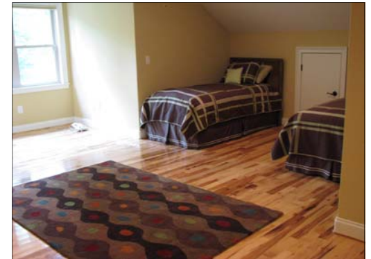
Bonus Room with Twin Beds